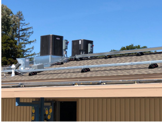
Roofing & HVAC (North & West)