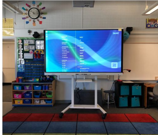
SmartBoards (all classrooms)