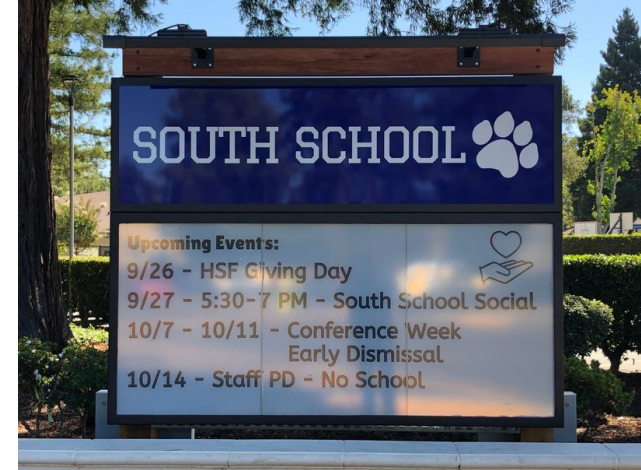
Marquee signs (all schools)